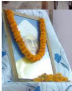
Teachers' Day Celebration

Students participate in Social and Cultural Activities. The Students' Union (Chhatra Samsad) actively helps the college authority in arranging the Social and Cultural Meet in through welcoming of the freshers, celebration of Teachers' Day and Birthdays of Noble Personalities.