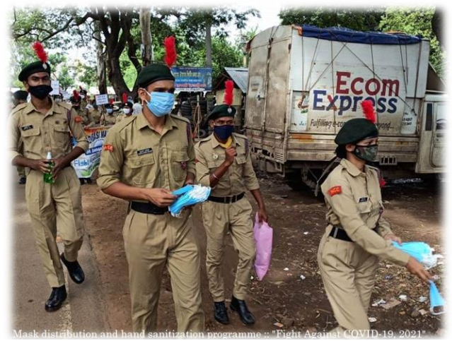
Mask distribution and hand sanitization programme :: "Fight Against COVID-19, 2021"